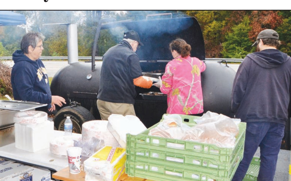
Good food was had by all during the Georgia Sheriffs' Youth Homes Fundraiser at Sundance Grill on Oct. 27.

By Jarrett Whitener Towns County Herald Staff Writer